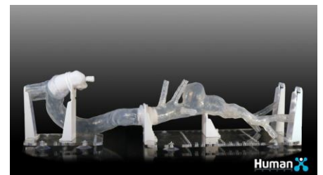
Vascular Phantom of Human X