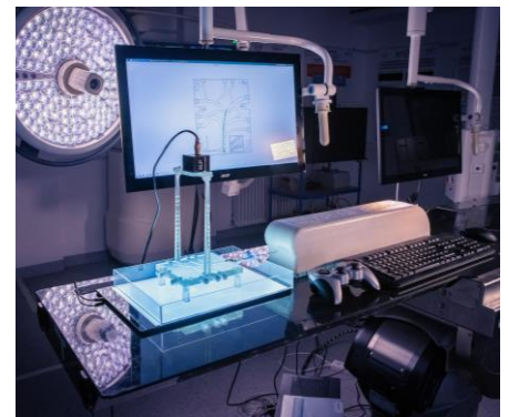
Catheter test bed of Fraunhofer IPA Mannheim